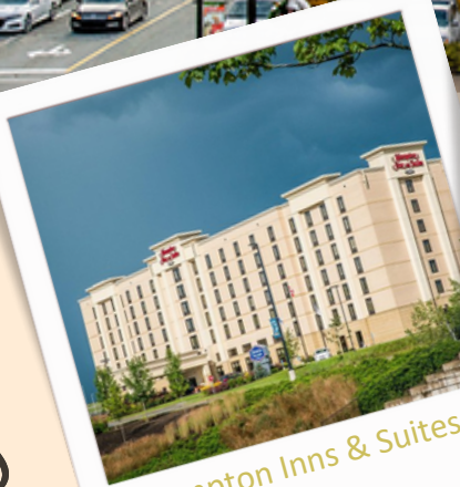
Hampton Inns & Suites by Hilton