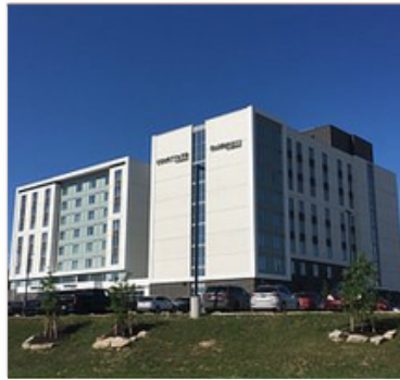
Courtyard by Marriott