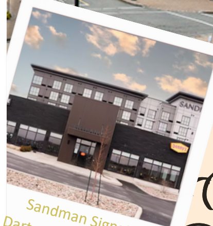
Sandman Signature Dartmouth Hotel & Suites